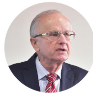
格列戈尔茨·科勒德克 教授 Prof. Grzegorz W. Kolodko

波兰前第一副总理兼财政部长 Former Deputy Premier and Minister of Finance of Poland