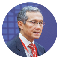
卓奥马尔特·奥托尔巴耶夫 教授 Prof. Djoomart Otorbaev

BRS values expertise. The faculty members are composed of extraordinary leaders and world-renowned experts in political, academic, finance, business management, and other fields whose work influences industry trends and practices.