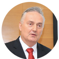
兹拉特科·拉古姆季亚 教授 Prof. Zlatko Lagumdžija

波兰前第一副总理兼财政部长 Former Deputy Premier and Minister of Finance of Poland