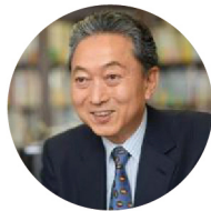
鸠山由纪夫 教授 Prof. Yukio Hatoyama

拉美开发银行前行长 Former President of CAF – Development Bank of Latin America